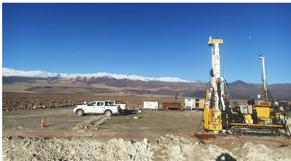
Figure 2: Photo of Hole RG23-005